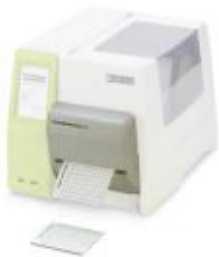
Cutter, for the THERMOMARK ROLL X1

Please be informed that the data shown in this PDF Document is generated from our Online Catalog. Please find the complete data in the user's documentation. Our General Terms of Use for Downloads are valid ( http://phoenixcontact.com/download )