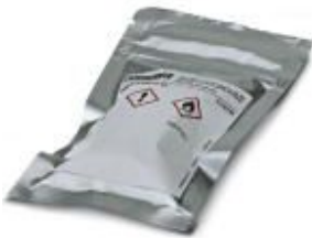
Cleaning cartridge, color: transparent

Please be informed that the data shown in this PDF Document is generated from our Online Catalog. Please find the complete data in the user's documentation. Our General Terms of Use for Downloads are valid ( http://phoenixcontact.com/download )