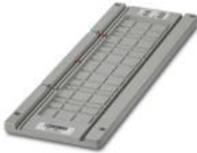
Magazine, for CMS-P1-PLOTTER, for accommodating UC-WMC 4.4...

Please be informed that the data shown in this PDF Document is generated from our Online Catalog. Please find the complete data in the user's documentation. Our General Terms of Use for Downloads are valid ( http://phoenixcontact.com/download )