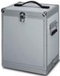
Transport case for THERMOMARK S1 thermal transfer printer, rounded profile case with aluminum frame

Please be informed that the data shown in this PDF Document is generated from our Online Catalog. Please find the complete data in the user's documentation. Our General Terms of Use for Downloads are valid ( http://phoenixcontact.com/download )