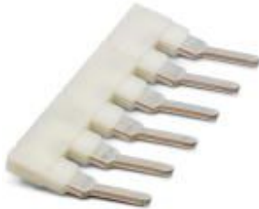
Star-delta bridge, 6-pos., insulated

Please be informed that the data shown in this PDF Document is generated from our Online Catalog. Please find the complete data in the user's documentation. Our General Terms of Use for Downloads are valid ( http://phoenixcontact.com/download )