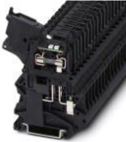
Lever-type fuse terminal block, black, for 5 x 20 mm G fuse inserts, with LED for 24 V DC

Please be informed that the data shown in this PDF Document is generated from our Online Catalog. Please find the complete data in the user's documentation. Our General Terms of Use for Downloads are valid ( http://phoenixcontact.com/download )