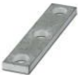
Connection rail, number of positions: 3, color: silver