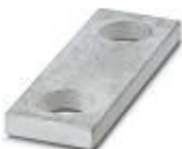
Connection rail, number of positions: 2, color: silver