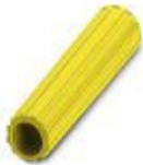
Insulating sleeve, color: yellow