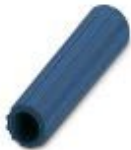
Insulating sleeve, color: blue