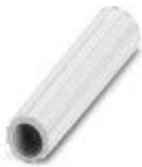
Insulating sleeve, color: white