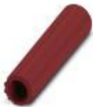
Insulating sleeve, color: red