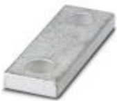
Connection rail, number of positions: 2, color: silver