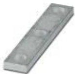
Connection rail, number of positions: 3, color: silver