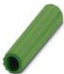
Insulating sleeve, color: green