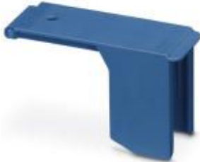
Covering hood, length: 164 mm, width: 49 mm, height: 33 mm, color: blue

Please be informed that the data shown in this PDF Document is generated from our Online Catalog. Please find the complete data in the user's documentation. Our General Terms of Use for Downloads are valid ( http://phoenixcontact.com/download )