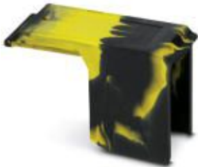
Covering hood, length: 85.6 mm, width: 28.8 mm, height: 46.7 mm, color: black/yellow

Please be informed that the data shown in this PDF Document is generated from our Online Catalog. Please find the complete data in the user's documentation. Our General Terms of Use for Downloads are valid ( http://phoenixcontact.com/download )