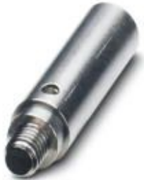
Female test connector, for 4 mm test plugs, for screwing into the bridge shaft, color: silver

Please be informed that the data shown in this PDF Document is generated from our Online Catalog. Please find the complete data in the user's documentation. Our General Terms of Use for Downloads are valid ( http://phoenixcontact.com/download )