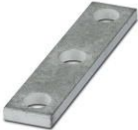
Connection rail, number of positions: 3, color: silver

Please be informed that the data shown in this PDF Document is generated from our Online Catalog. Please find the complete data in the user's documentation. Our General Terms of Use for Downloads are valid ( http://phoenixcontact.com/download )