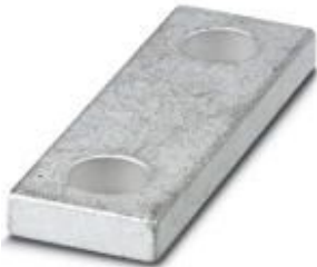
Connection rail, number of positions: 2, color: silver

Please be informed that the data shown in this PDF Document is generated from our Online Catalog. Please find the complete data in the user's documentation. Our General Terms of Use for Downloads are valid ( http://phoenixcontact.com/download )