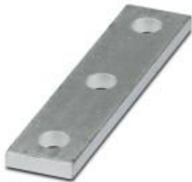
Connection rail, number of positions: 3, color: silver

Please be informed that the data shown in this PDF Document is generated from our Online Catalog. Please find the complete data in the user's documentation. Our General Terms of Use for Downloads are valid ( http://phoenixcontact.com/download )