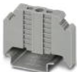
End clamp, width: 9.5 mm, color: gray