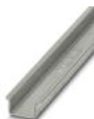
DIN rail, unperforated, Standard profile 2.3 mm, width: 35 mm, height: 15 mm, acc. to EN 60715, material: Steel, galvanized, passivated with a thick layer, length: 2000 mm, color: silver

DIN rail, unperforated - NS 35/15-2,3 UNPERF 2000MM - 1201798