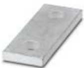
Connection rail, number of positions: 2, color: silver