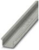
DIN rail, unperforated, Standard profile 2.3 mm, width: 35 mm, height: 15 mm, acc. to EN 60715, material: Steel, galvanized, passivated with a thick layer, length: 2000 mm, color: silver

DIN rail, unperforated - NS 35/15-2,3 UNPERF 2000MM - 1201798