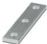
Connection rail, number of positions: 3, color: silver