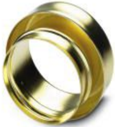
End sleeves as cable protection, made of brass, for WP-STEEL PVC C

Please be informed that the data shown in this PDF Document is generated from our Online Catalog. Please find the complete data in the user's documentation. Our General Terms of Use for Downloads are valid ( http://phoenixcontact.com/download )