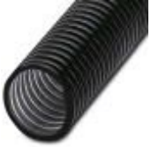
Galvanized steel protective hose with PVC coating

Protective hose - WP-STEEL PVC C 45 - 3240873