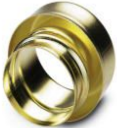
End sleeves as cable protection, made of brass, for WP-STEEL PVC C

Please be informed that the data shown in this PDF Document is generated from our Online Catalog. Please find the complete data in the user's documentation. Our General Terms of Use for Downloads are valid ( http://phoenixcontact.com/download )