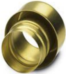
End sleeves as cable protection, made of brass, for WP-STEEL PVC C

Please be informed that the data shown in this PDF Document is generated from our Online Catalog. Please find the complete data in the user's documentation. Our General Terms of Use for Downloads are valid ( http://phoenixcontact.com/download )