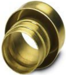
End sleeves as cable protection, made of brass, for WP-STEEL PVC C

Please be informed that the data shown in this PDF Document is generated from our Online Catalog. Please find the complete data in the user's documentation. Our General Terms of Use for Downloads are valid ( http://phoenixcontact.com/download )