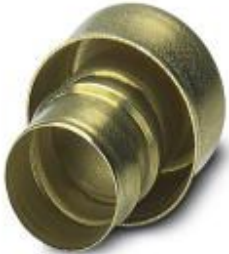
End sleeves as cable protection, made of brass, for WP-STEEL PVC C

Please be informed that the data shown in this PDF Document is generated from our Online Catalog. Please find the complete data in the user's documentation. Our General Terms of Use for Downloads are valid ( http://phoenixcontact.com/download )