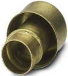
End sleeves as cable protection, made of brass, for WP-STEEL PVC C

Please be informed that the data shown in this PDF Document is generated from our Online Catalog. Please find the complete data in the user's documentation. Our General Terms of Use for Downloads are valid ( http://phoenixcontact.com/download )