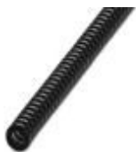
Galvanized steel protective hose with PVC coating

Protective hose - WP-STEEL PVC C 14 - 3240868