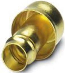
End sleeves as cable protection, made of brass, for WP-STEEL PVC C

Please be informed that the data shown in this PDF Document is generated from our Online Catalog. Please find the complete data in the user's documentation. Our General Terms of Use for Downloads are valid ( http://phoenixcontact.com/download )