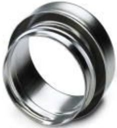
End sleeves as cable protection, made of brass

Please be informed that the data shown in this PDF Document is generated from our Online Catalog. Please find the complete data in the user's documentation. Our General Terms of Use for Downloads are valid ( http://phoenixcontact.com/download )