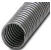
Protective hose in galvanized steel

Protective hose - WP-STEEL ZC 45 - 3240701