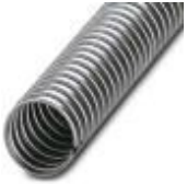
Protective hose in galvanized steel

Protective hose - WP-STEEL ZC 36 - 3240700