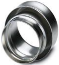
End sleeves as cable protection, made of brass

Please be informed that the data shown in this PDF Document is generated from our Online Catalog. Please find the complete data in the user's documentation. Our General Terms of Use for Downloads are valid ( http://phoenixcontact.com/download )