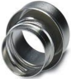
End sleeves as cable protection, made of brass

Please be informed that the data shown in this PDF Document is generated from our Online Catalog. Please find the complete data in the user's documentation. Our General Terms of Use for Downloads are valid ( http://phoenixcontact.com/download )