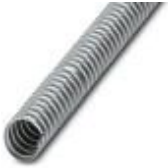
Protective hose in galvanized steel

Protective hose - WP-STEEL ZC 21 - 3240699