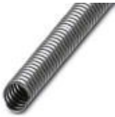
Protective hose in stainless steel

Protective hose - WP-STEEL S 21 - 3240688