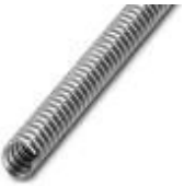
Protective hose in stainless steel

Protective hose - WP-STEEL S 17 - 3240863