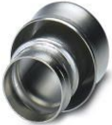
End sleeves as cable protection, made of brass

Please be informed that the data shown in this PDF Document is generated from our Online Catalog. Please find the complete data in the user's documentation. Our General Terms of Use for Downloads are valid ( http://phoenixcontact.com/download )