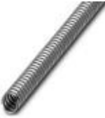
Protective hose in stainless steel

Protective hose - WP-STEEL S 14 - 3240687