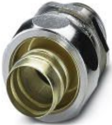
Cable gland made from brass with metric thread, IP65 protection

Please be informed that the data shown in this PDF Document is generated from our Online Catalog. Please find the complete data in the user's documentation. Our General Terms of Use for Downloads are valid ( http://phoenixcontact.com/download )