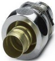
Cable gland made from brass with metric thread, IP65 protection

Please be informed that the data shown in this PDF Document is generated from our Online Catalog. Please find the complete data in the user's documentation. Our General Terms of Use for Downloads are valid ( http://phoenixcontact.com/download )