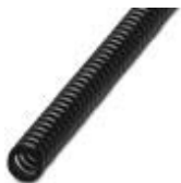
Galvanized steel protective hose with PVC coating

Protective hose - WP-STEEL PVC C 17 - 3240869