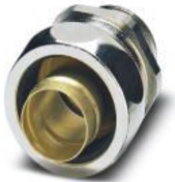
Cable gland made from brass with metric thread, IP65 protection

Please be informed that the data shown in this PDF Document is generated from our Online Catalog. Please find the complete data in the user's documentation. Our General Terms of Use for Downloads are valid ( http://phoenixcontact.com/download )