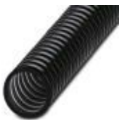
Galvanized steel protective hose with PVC coating

Protective hose - WP-STEEL PVC C 36 - 3240872