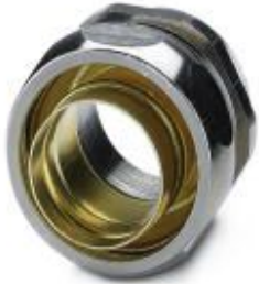
Cable gland made from brass with Pg thread, IP65 protection

Please be informed that the data shown in this PDF Document is generated from our Online Catalog. Please find the complete data in the user's documentation. Our General Terms of Use for Downloads are valid ( http://phoenixcontact.com/download )