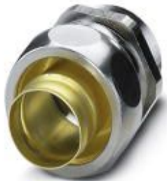
Cable gland made from brass with Pg thread, IP65 protection

Please be informed that the data shown in this PDF Document is generated from our Online Catalog. Please find the complete data in the user's documentation. Our General Terms of Use for Downloads are valid ( http://phoenixcontact.com/download )