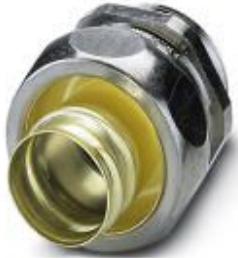
Cable gland made from brass with Pg thread, IP65 protection

Please be informed that the data shown in this PDF Document is generated from our Online Catalog. Please find the complete data in the user's documentation. Our General Terms of Use for Downloads are valid ( http://phoenixcontact.com/download )