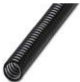
Galvanized steel protective hose with PVC coating

Protective hose - WP-STEEL PVC C 21 - 3240870