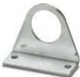
Fixing bracket for protective sleeves, fixed with two screws

Protective hose fixing bracket - WP-BASE A PG16 - 3241079