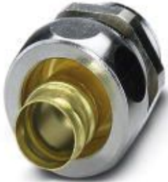
Cable gland made from brass with Pg thread, IP65 protection

Please be informed that the data shown in this PDF Document is generated from our Online Catalog. Please find the complete data in the user's documentation. Our General Terms of Use for Downloads are valid ( http://phoenixcontact.com/download )