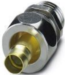
Cable gland made from brass with Pg thread, IP65 protection

Please be informed that the data shown in this PDF Document is generated from our Online Catalog. Please find the complete data in the user's documentation. Our General Terms of Use for Downloads are valid ( http://phoenixcontact.com/download )