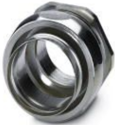
Cable gland made from brass with metric thread, IP40 protection

Please be informed that the data shown in this PDF Document is generated from our Online Catalog. Please find the complete data in the user's documentation. Our General Terms of Use for Downloads are valid ( http://phoenixcontact.com/download )