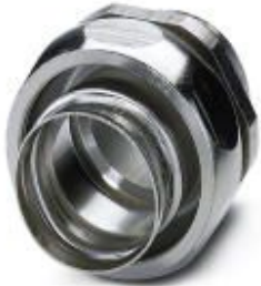
Cable gland made from brass with metric thread, IP40 protection

Please be informed that the data shown in this PDF Document is generated from our Online Catalog. Please find the complete data in the user's documentation. Our General Terms of Use for Downloads are valid ( http://phoenixcontact.com/download )