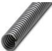
Protective hose in stainless steel

Protective hose - WP-STEEL S 27 - 3240864