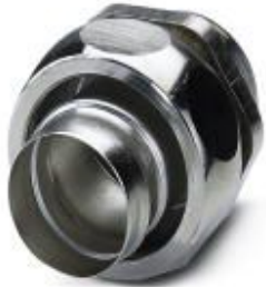
Cable gland made from brass with metric thread, IP40 protection

Please be informed that the data shown in this PDF Document is generated from our Online Catalog. Please find the complete data in the user's documentation. Our General Terms of Use for Downloads are valid ( http://phoenixcontact.com/download )