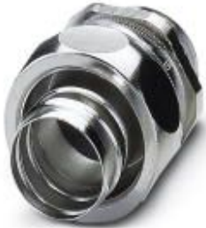
Cable gland made from brass with metric thread, IP40 protection

Please be informed that the data shown in this PDF Document is generated from our Online Catalog. Please find the complete data in the user's documentation. Our General Terms of Use for Downloads are valid ( http://phoenixcontact.com/download )