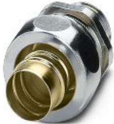
Cable gland made from brass with metric thread, IP40 protection

Please be informed that the data shown in this PDF Document is generated from our Online Catalog. Please find the complete data in the user's documentation. Our General Terms of Use for Downloads are valid ( http://phoenixcontact.com/download )