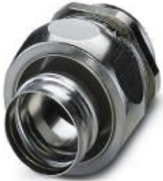
Cable gland made from brass with Pg thread, IP40 protection

Please be informed that the data shown in this PDF Document is generated from our Online Catalog. Please find the complete data in the user's documentation. Our General Terms of Use for Downloads are valid ( http://phoenixcontact.com/download )