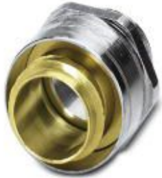
Cable gland made from brass with metric thread, rotatable, IP40 protection

Please be informed that the data shown in this PDF Document is generated from our Online Catalog. Please find the complete data in the user's documentation. Our General Terms of Use for Downloads are valid ( http://phoenixcontact.com/download )