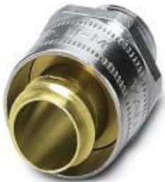
Cable gland made from brass with metric thread, rotatable, IP40 protection

Please be informed that the data shown in this PDF Document is generated from our Online Catalog. Please find the complete data in the user's documentation. Our General Terms of Use for Downloads are valid ( http://phoenixcontact.com/download )