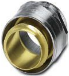
Cable gland made from brass with Pg thread, rotatable, IP40 protection

Please be informed that the data shown in this PDF Document is generated from our Online Catalog. Please find the complete data in the user's documentation. Our General Terms of Use for Downloads are valid ( http://phoenixcontact.com/download )