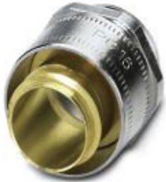
Cable gland made from brass with Pg thread, rotatable, IP40 protection

Please be informed that the data shown in this PDF Document is generated from our Online Catalog. Please find the complete data in the user's documentation. Our General Terms of Use for Downloads are valid ( http://phoenixcontact.com/download )