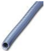
Protective hose, spring steel wire with PU coating, highly stranded