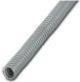
Protective hose, spring steel wire with PVC coating, highly stranded