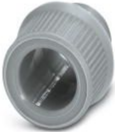
End sleeves as cable protection

Please be informed that the data shown in this PDF Document is generated from our Online Catalog. Please find the complete data in the user's documentation. Our General Terms of Use for Downloads are valid ( http://phoenixcontact.com/download )