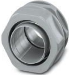
Cable gland made from PP with metric thread, IP65 protection

Please be informed that the data shown in this PDF Document is generated from our Online Catalog. Please find the complete data in the user's documentation. Our General Terms of Use for Downloads are valid ( http://phoenixcontact.com/download )