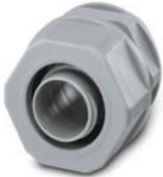
Cable gland made from PP with metric thread, IP65 protection

Please be informed that the data shown in this PDF Document is generated from our Online Catalog. Please find the complete data in the user's documentation. Our General Terms of Use for Downloads are valid ( http://phoenixcontact.com/download )